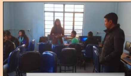
CUSTOMER CARE EXECUTIVE