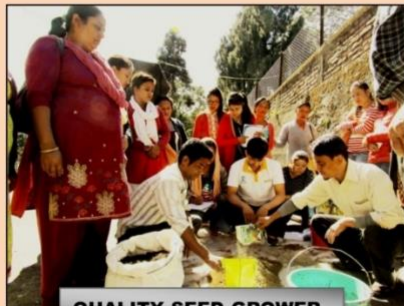
QUALITY SEED GROWER