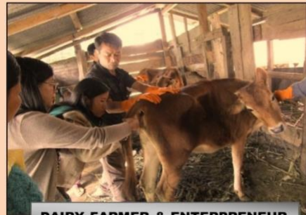
DAIRY FARMER & ENTREPRENEUR